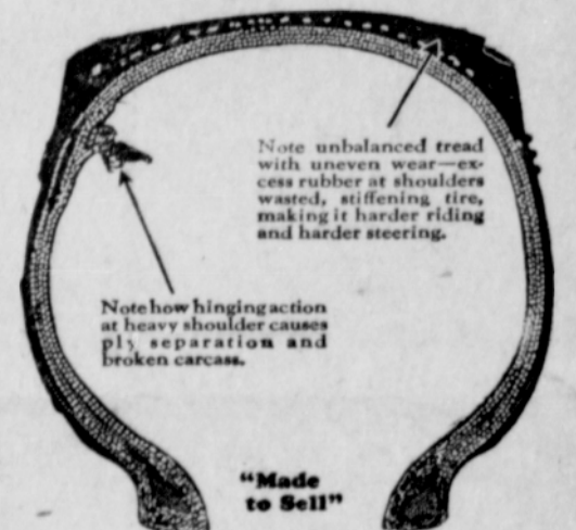
Flat Tread Balloon

Firestone Dealers are given the advantages of attending Tire Educational Meetings held throughout the country, where tire design and construction are discussed. The sections of used tires reproduced here are a part of this program. Study these two sections and you, too, will understand what Firestone means by tires built for service and tires made to sell.