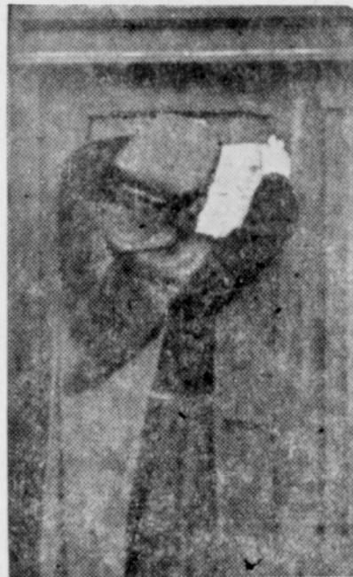
Martin Luther nailing the 95 Theses on the university church at Wittenberg, Germany, in 1517, which led to the Great Protestant Reformation.

Four hundred years ago the world was thrilled and awakened by the Great Reformer, Martin Luther. Today, thanks to the great motion picture art, Luther's Life and Time reflected on the silver screen is bringing him again into our midst, living the stormy days of the Reformation, and moral heroism of the highest order born of Christian faith and conviction. This is the most startling, historic reproduction this country has had the privilege of witnessing. This masterpiece is moving like a stupendous avalanche sweeping all before it as it makes its advent into each state. It is sought after by people far and wide. With its clean sweep it is leaving a better understanding of its powerful appeal of God and Truth, and its historical acclamations of the life and inspiring message of the Great Reformer.