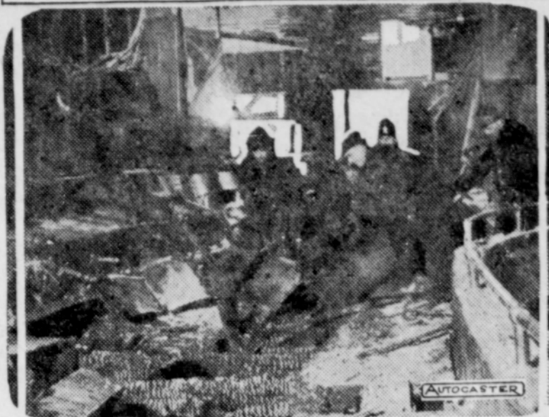
Scene shows firemen searching the balcony of the Laurier Theatre, Montreal, Canada, where 76 children lost their lives. Panic gripped the tiny hearts at the cry of FIRE, and death took heavy toll.