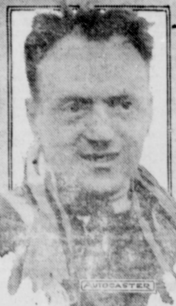
Major Mario De Bernadi, Italian aviation ace who established a new world speed record of 264.4 miles per hour to win the Schneider Cup at Norfolk, Va.