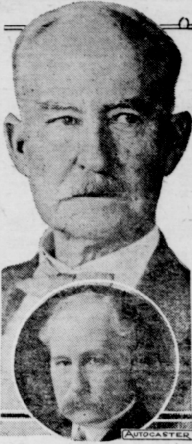
Above—Albert B. Fall, former Secretary of the Interior as he is today, this photo being taken at Washington last week, as he arrived from New Mexico to defend himself. Below, Mr. Fall as he looked before being indicted on the charges of alleged conspiracy to defraud the government in granting oil leases.