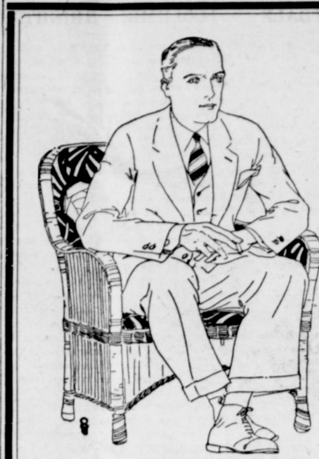
Hats and Furnishings to harmonize. Shoes, too.

Come here for your SODAS CANDIES ICE CREAM