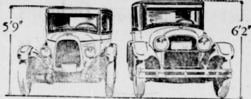
Compared with old-fashioned big, bulky cars the Whippet appears smaller and much more graceful