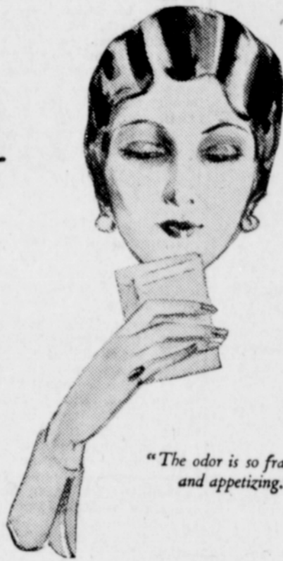
"The odor is so fragrant and appetizing."

From rock-bound Maine to sun-kissed California, they wrote to New York for this new delicious dessert