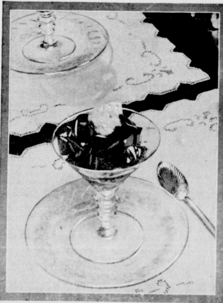
ROYAL STRAWBERRY: "Its flavor is true to the fruit—no artificial taste at all," writes a delighted woman.

NOW it's in your own town, you can buy it today. Royal Fruit Flavored Gelatin comes in five flavors. Strawberry, Raspberry, Cherry—with delicious flavor from the fruit juices. Orange and Lemon with delicious flavor from Oil of Orange and Oil of Lemon.