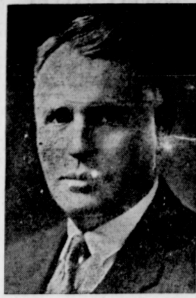
Frederick W. Steiwer.