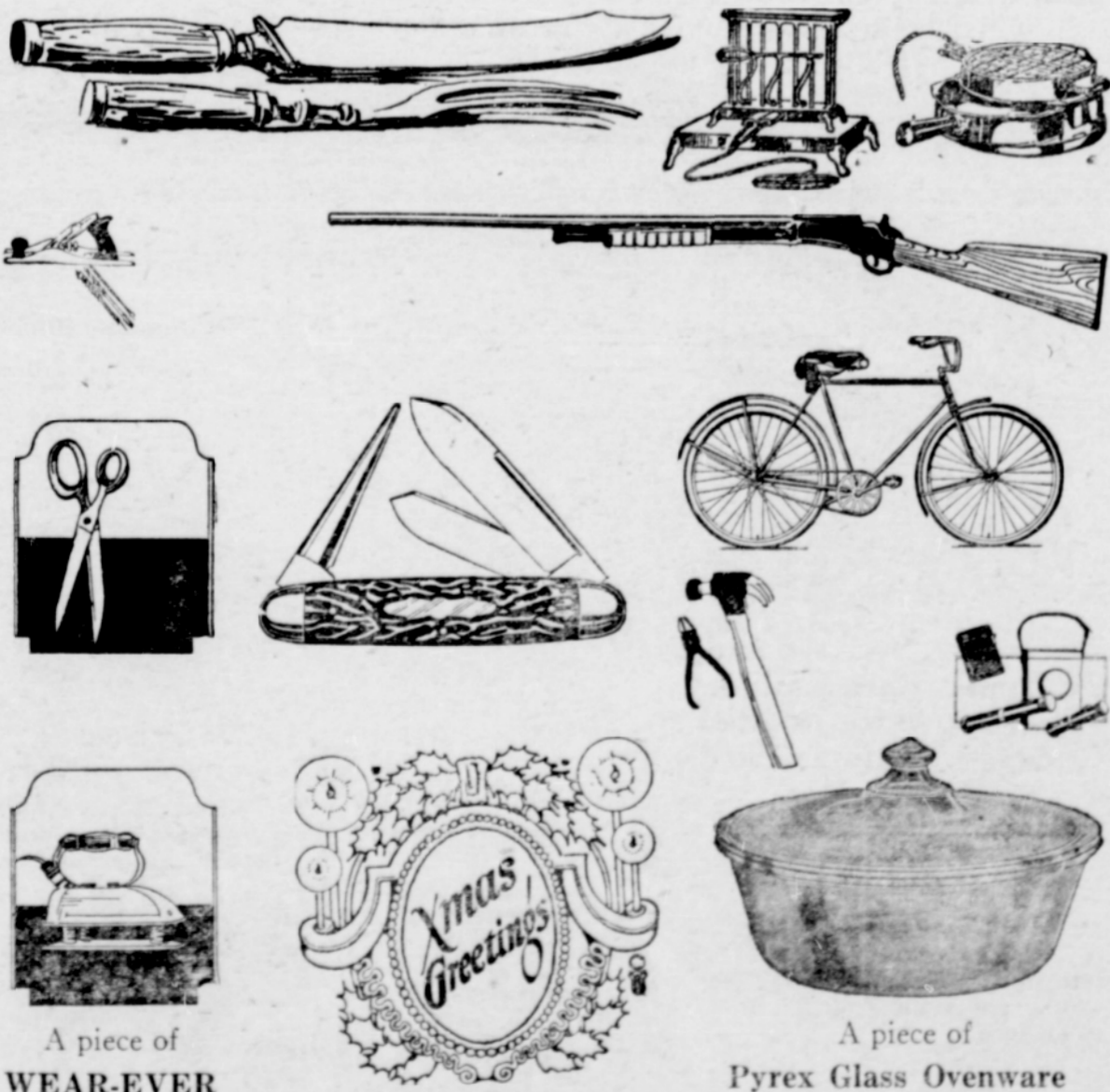
A piece of WEAR-EVER

Our Christmas Stock is more complete than ever before You will find in our store GIFTS for every member of the family from the youngest to the oldest.