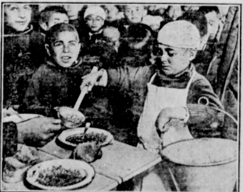
Meal time at a Near East Relief Orphanage in Armenia. The four cent menu is urged upon American housewives for the observance of International Golden Rule Sunday on December 6th to aid child rescue and welfare work in the Near East.