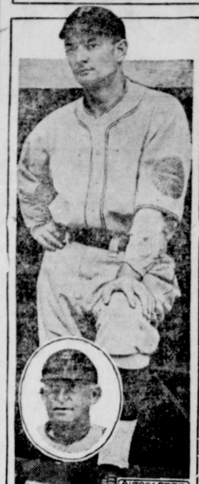
Bill McKetchnie, manager of Pittsburgh Pirates and "the wonder man" of 1925 baseball. Insert in other penant days—and now helps McKetchnie keep the Pirates out in fount.