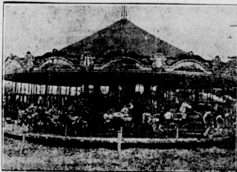
LEVITT-BROWN-HUGGINS $20,000 CAROUSEL

Special care is taken to furnish amusement for the youngsters. The very small ones. They enjoy riding, too, but cautious mammas and incidentally the show management are inclined to be careful, so miniature replicas of some of the big rides have been made to insure fun for the little ones and at the same time guarantee their safety. They are merry-go-round, Ferris wheel, whip and seaplanes.