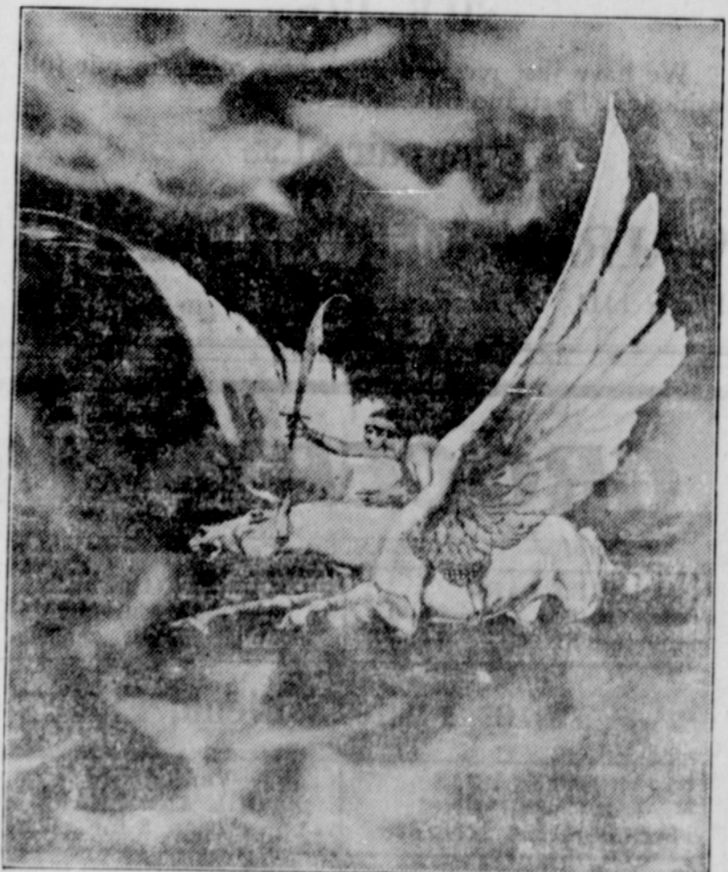
One of the amazing features of THE THIEF OF BAGDAD is Douglas Fairbanks' dashing ride through the clouds astride a Winged Horse.