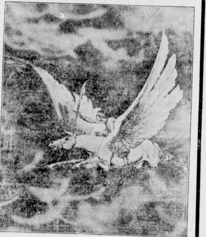
One of the amazing features of THE THIEF OF BAGDAD is Douglas Fairbanks' dashing ride through the clouds astride a Winged Horse.

Do You —Believe in love —Think life should be sweetened with laughter —Like the thrill of the unexpected?