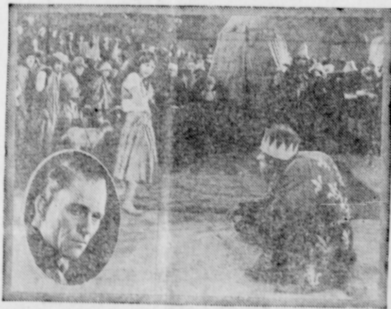
The above is a scene from The Hunchback of Notre Dame, showing Quasimodo the hunchback. In the background is Esmeralda, played by Patsy Ruth Miller. The insert shows Lon Chaney who plays the hunchback.