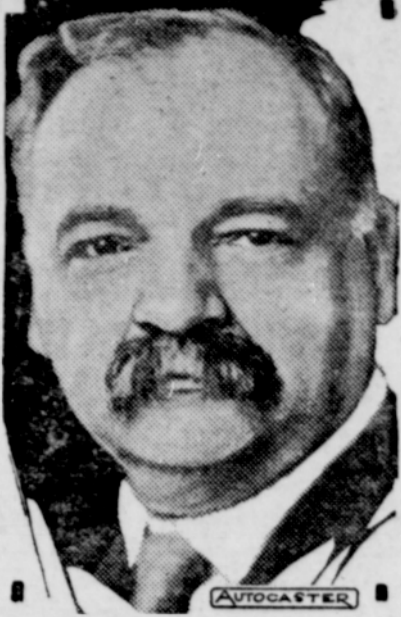
Sen. Charles Curtis of Kansas is the new Republican leader in the Senate, elected after senior Senator Warren of Wyoming declined. Senator Curtis is more than half American Indian.