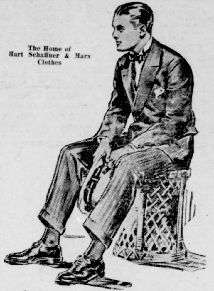
Copyright 1924 Hart Schaffner & Marx

The Home of Hart Schaffner & Marx Clothes