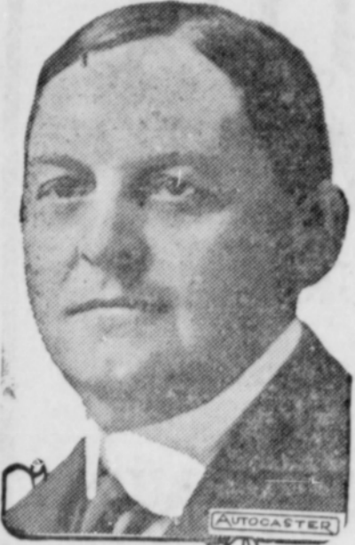
Senator Oscar Underwood, of Alabama, is looked upon with great favor in the South as the logical candidate for the Democratic Presidential nomination.