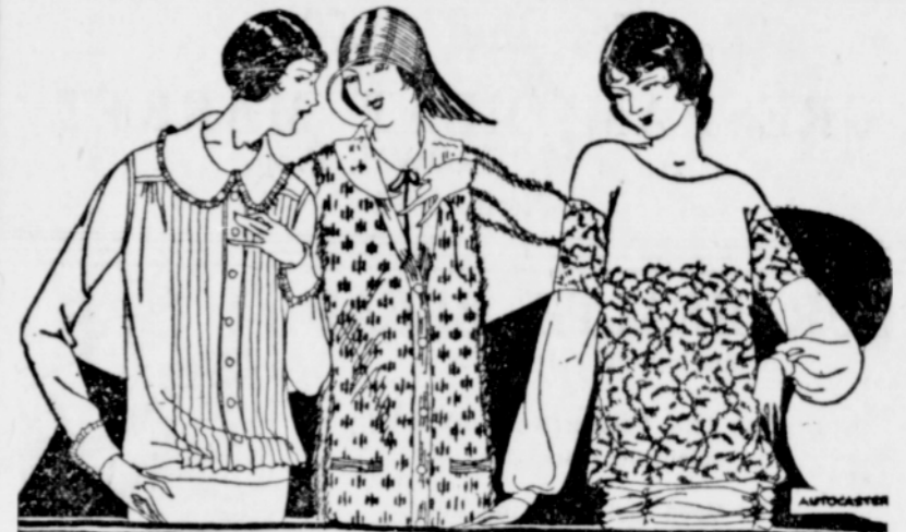
A BLOUSE—A SWEATER—A BLOUSE