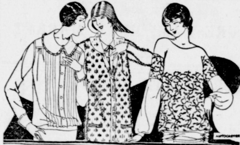
A BLOUSE—A SWEATER—A BLOUSE