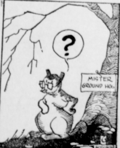
Looking forward to Feb. 2d.

Maybe what you don't need some one else wants. Try an ad in the classified.