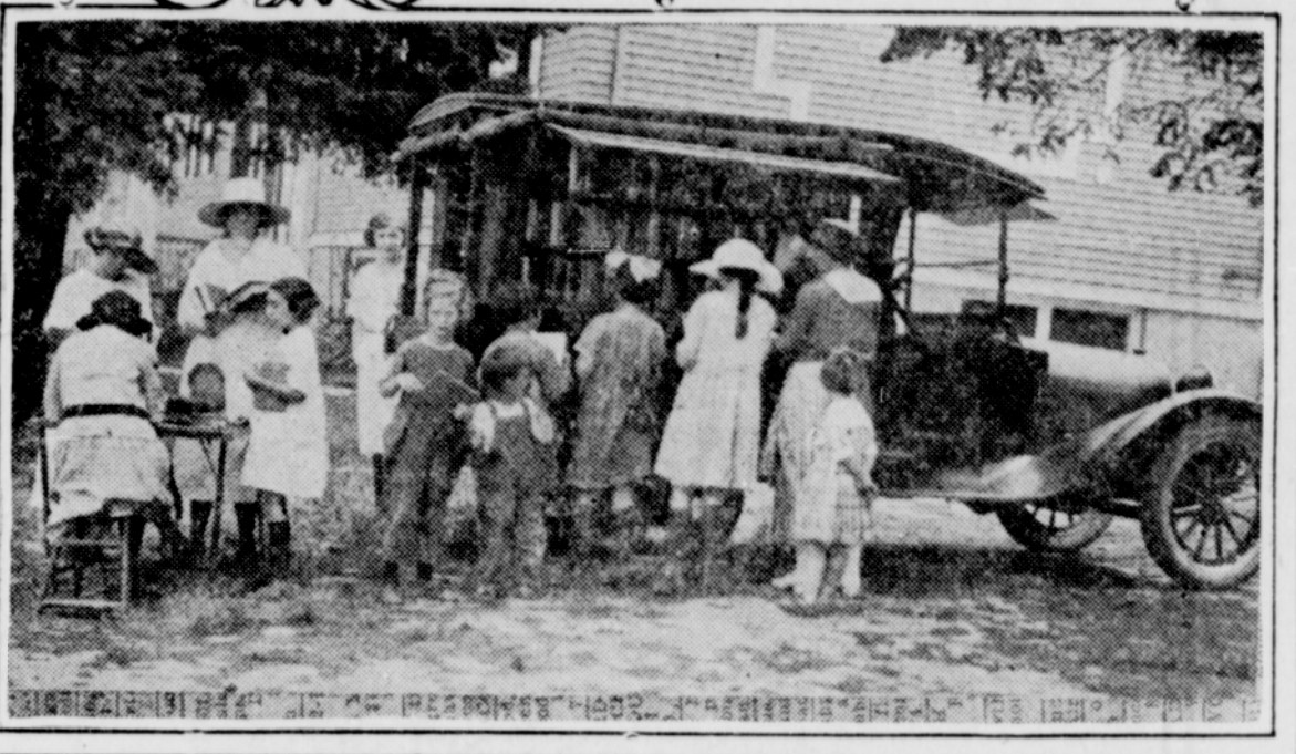
In the Summer the Public Library Book Wagon Brings the Books Directly to the People.

The close of 1923 finds the library in a prosperous and growing condition.