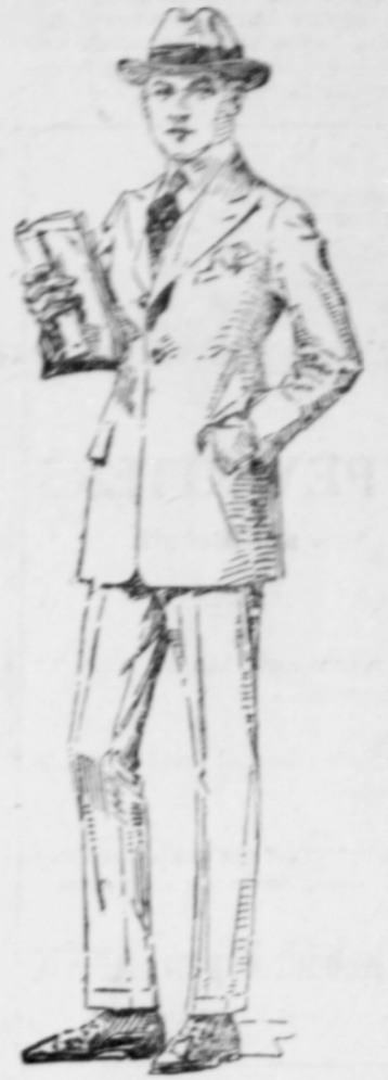
SHOES For Men, Women and Children.

Aylsworth & Martin Inc. MEN'S WEAR SHOES GRESHAM