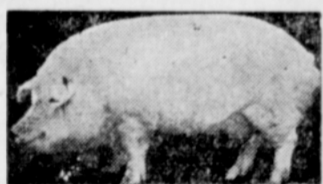
BORING, OREGON, Rt. 1 Telephone 39x