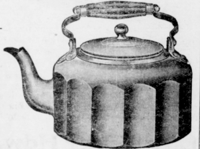
Heavy 8- and 9-Qt. Paneled Tea Kettle.