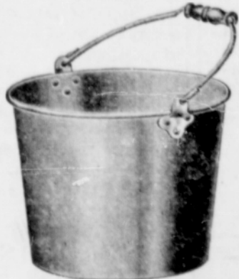
Heavy 12-Qt. Water Pail.