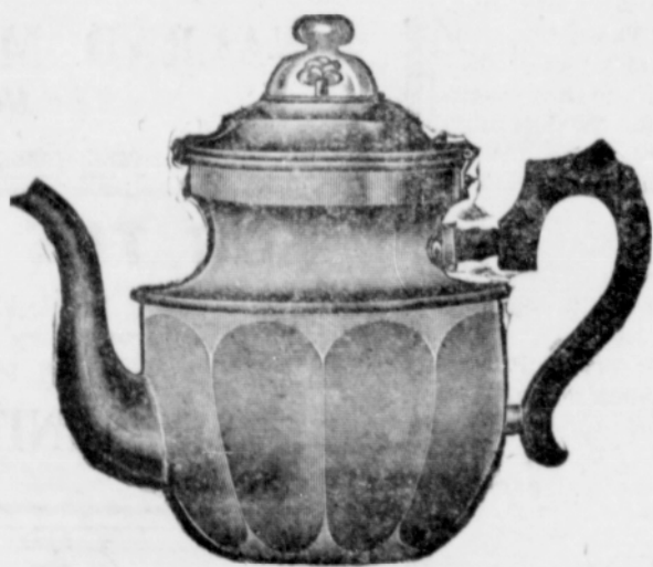
Heavy 2-Qt. Paneled Coffee Percolator