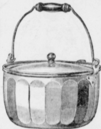
Heavy 8-Qt. Paneled Preserving Kettle.

Sale Starts Promptly at 2 p. m. Next SATURDAY