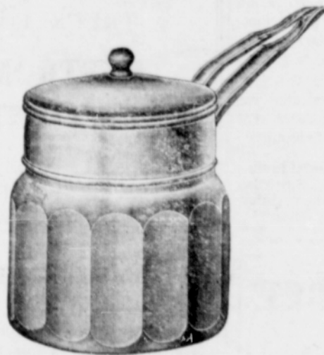
Heavy 2-Qt. Paneled Double Boiler