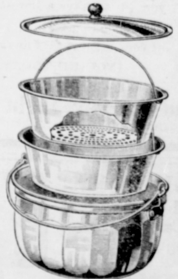
Heavy Paneled Combination Cooking Set.

EXTRA SPECIAL!! OUR ENTIRE STOCK OF ALUMINUM WARE AT SPECIAL PRICES FOR SATURDAY ONLY