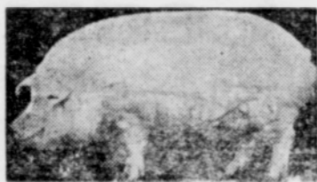
BORING, OREGON, Rt. 1 Telephone 39x