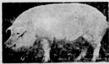
BORING, OREGON, Rt. 1 Telephone 39x