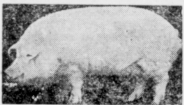
BORING, OREGON, R. 1 Telephone 39x