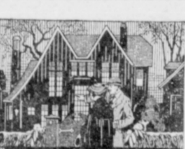
This must be the house