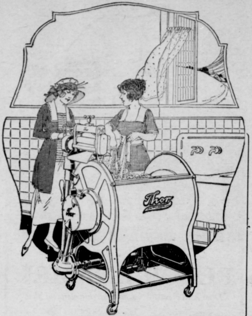
The new model No. 32 THOR..... $152.00