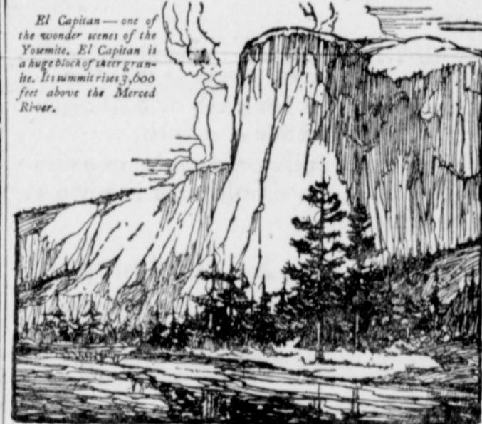
El Capitan—one of the wonder scenes of the Yosemite. El Capitan is a huge block of granite. Its summit rises 3,600 feet above the Merced River.