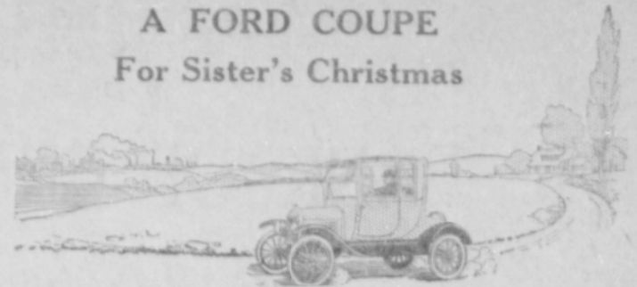
A FORD COUPE For Sister's Christmas

WE HAVE A FULL LINE OF GENUINE FORD PARTS WHICH WILL BE USED IN YOUR CAR, AND THE WORK WILL BE DONE BY FORD MECHANICS.