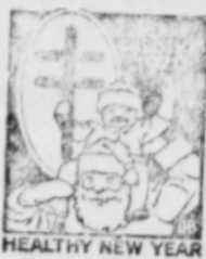
HEALTHY NEW YEAR