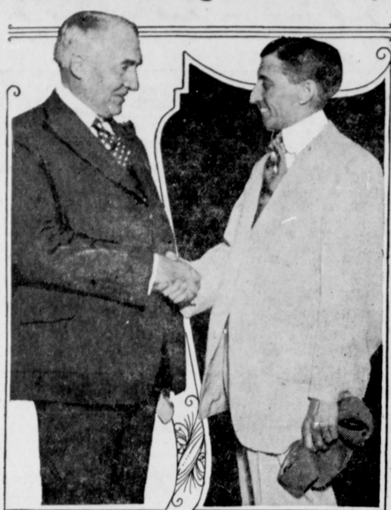
The Republican nominee receiving the congratulations of the man who will manage his campaign. Senator Harding has been selected to head the Republican ticket and Will H. Hays is Chairman of the Republican National Committee.