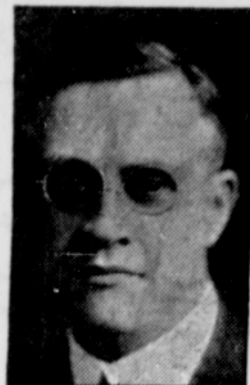
"Oregon's Choice Is My Choice"

"She is as sweet as she is fair None none on earth above her, As bright in thought as angels are, To know her is to love her."