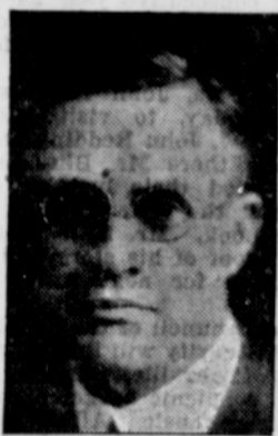
"Oregon's Choice is My Choice"

Does your suit need cleaning? The Gresham Steam Laundry will do it for you. Give us a trial.—Adv.