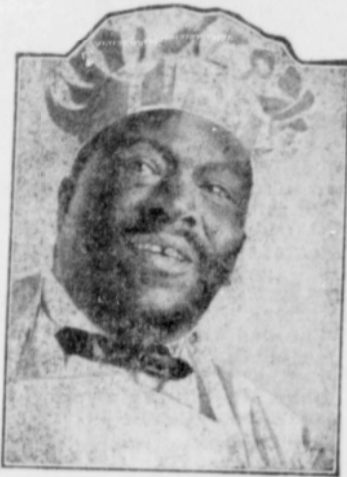
Fisher's Famous Chef Will Serve Scones