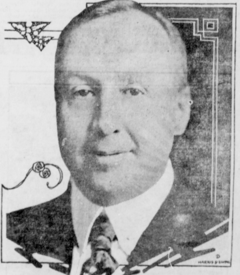
Maryland's Junior Senator.

United States Senator Joseph I. France, Republican, of Maryland, is a physician and surgeon, and since entering public life he has naturally taken an especial interest in the betterment of the public health service. He has recently proposed a survey of the various activities of the government pertaining to public health, sanitation and the care of the sick and injured, with a view to making recommendations for their expansion and improvement.