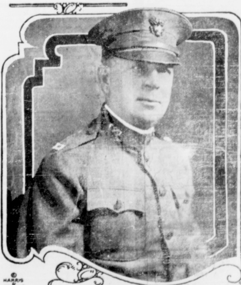
Hon. Albert Johnson.

Representative Johnson of Washington state, the chairman of the House on immigration, is conducting a searching investigation of Ellis Island, which has revealed the fact that a large percentage of dangerous aliens, who have been ordered deported, are still in the United States and enjoying absolute freedom under a nominal bond. His committee will push legislation to make more effective both the deportation and immigration regulations affecting alien anarchists. Mr. Johnson was one of the members of Congress who entered the military service during the recent war. He is a newspaper man of Hoquiam, Washington.