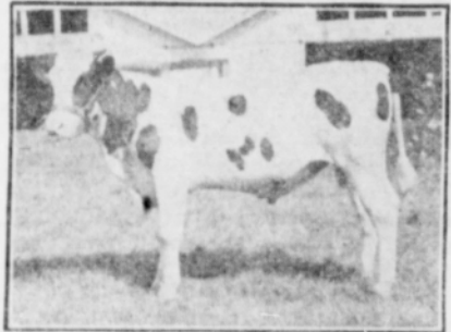
THE KIND WE BREED. He went to his grave undefeated

The sire of this young bull stands at the head of our herd. He is better known as the $10,000 bull.