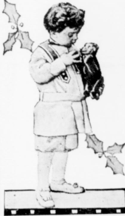
When in doubt try a Want Ad. Read the Want Ads.