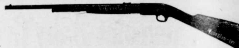
Give the boy a 22 rifle. It will make a good shot of him.