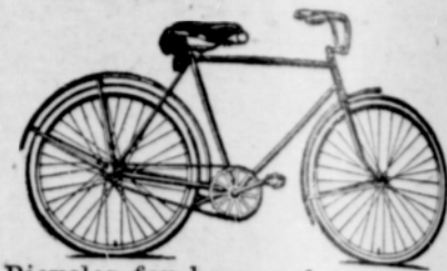
Bicycles for boys and men $30.00 to $50.00