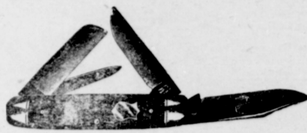
Pocket Knives that fit the pocket and hold the edge.

Select your gifts early and save the worry at the last hour.