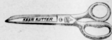
Keen Kutter line Shears and Scissors. Nuff sed.