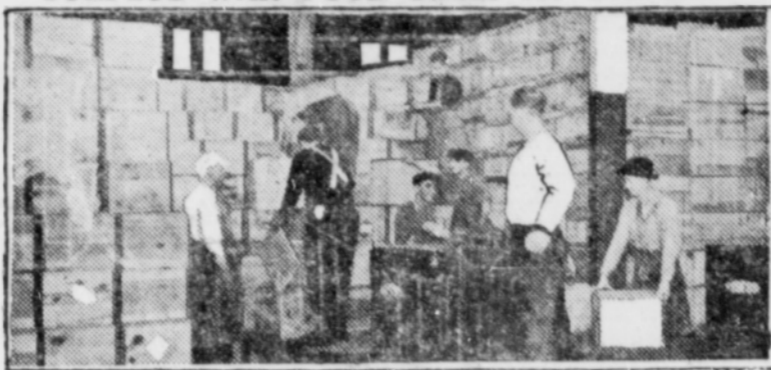
Old high cost of living is getting a jolt now as Uncle Sam sells surplus food stuffs bought up for war purposes. The surplus will be placed in the hands of consumers through various cities. Here shows immense stores for five big eastern cities. Bacon at 34 cents—beef hash at 23 cents—shows the immense saving possible for the consumer.