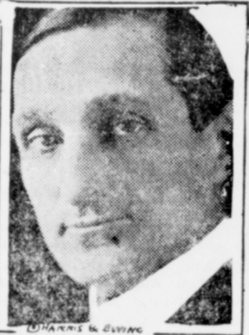
WILLIAM G. McADOO

The following communication by W. G. McAdoo, is under date of December 4, when he was secretary of the United States Treasury. As will be seen, it is addressed to the soldiers and sailors of America, and now for the purpose of more clearly impressing the matter of retaining their government insurance upon it is given to the Outlook and other papers for publication. The article explains the continuation and conversion features of Uncle Sam's insurance. It follows: