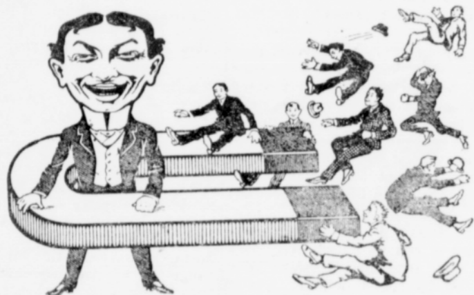
An Ad in the OUTLOOK will help you draw business EVERYBODY READS IT!