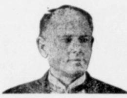
Twelve to be Elected in Multnomah County