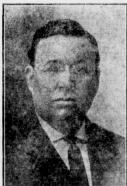
Primaries, May 17