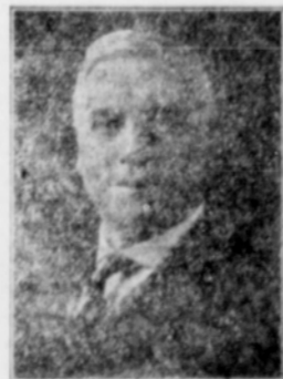
Primaries May 17, 1918