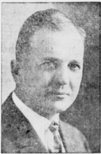
R. N. STANFIELD

Republican Candidate for United States Senator