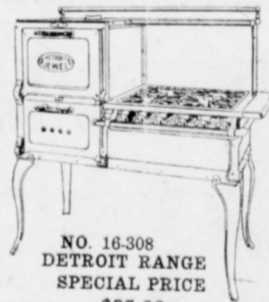
NO. 16-308 DETROIT RANGE SPECIAL PRICE $35.00