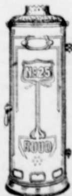
NO. 25 RUUD WATER HEATER SPECIAL PRICE $18.00