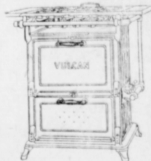
NO. 835 VULCAN RANGE SPECIAL PRICE $26.50

Take Advantage of these SPECIAL PRICES Effective for a Short Time Beginning JUNE 25. The Past few Days Should Remind you that You Want and Need a Cool, Comfortable Kitchen. All Ranges and Water Heaters Installed Free of Charge. We Guarantee and Stand Back of Our Appliances.