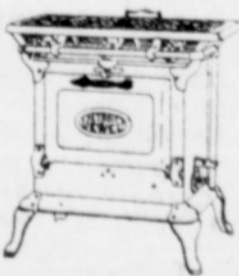
NO. 16-311 DETROIT RANGE SPECIAL PRICE $16.00