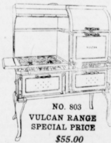
NO. 803 VULCAN RANGE SPECIAL PRICE $55.00