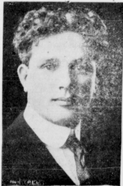
THE MAN OF CHARACTER