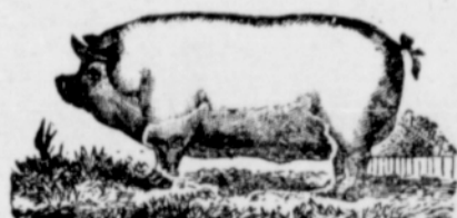
BERKSHIRE HOG FEED $35 a ton