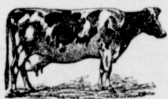
HOLSTEIN DAIRY FEED $25 a ton