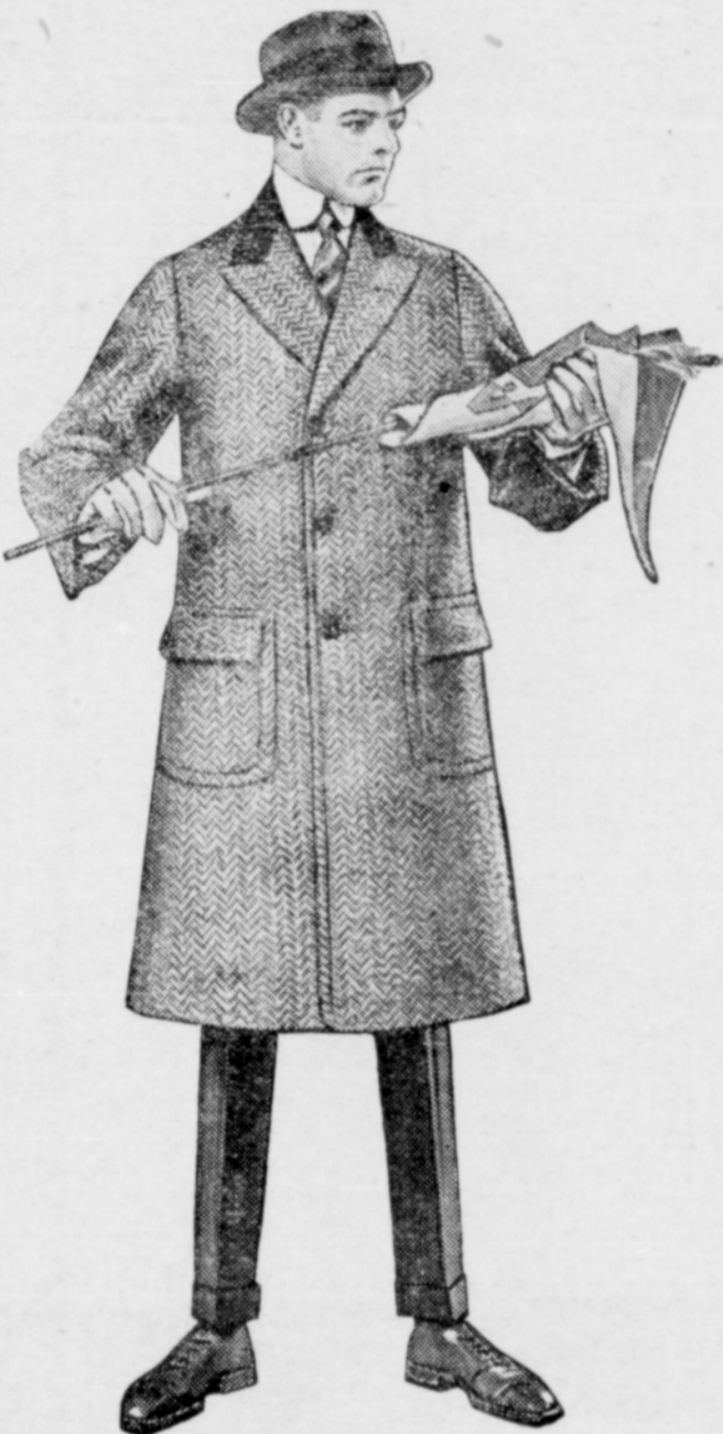
Copyright 1916 The House of Kuppenheimer